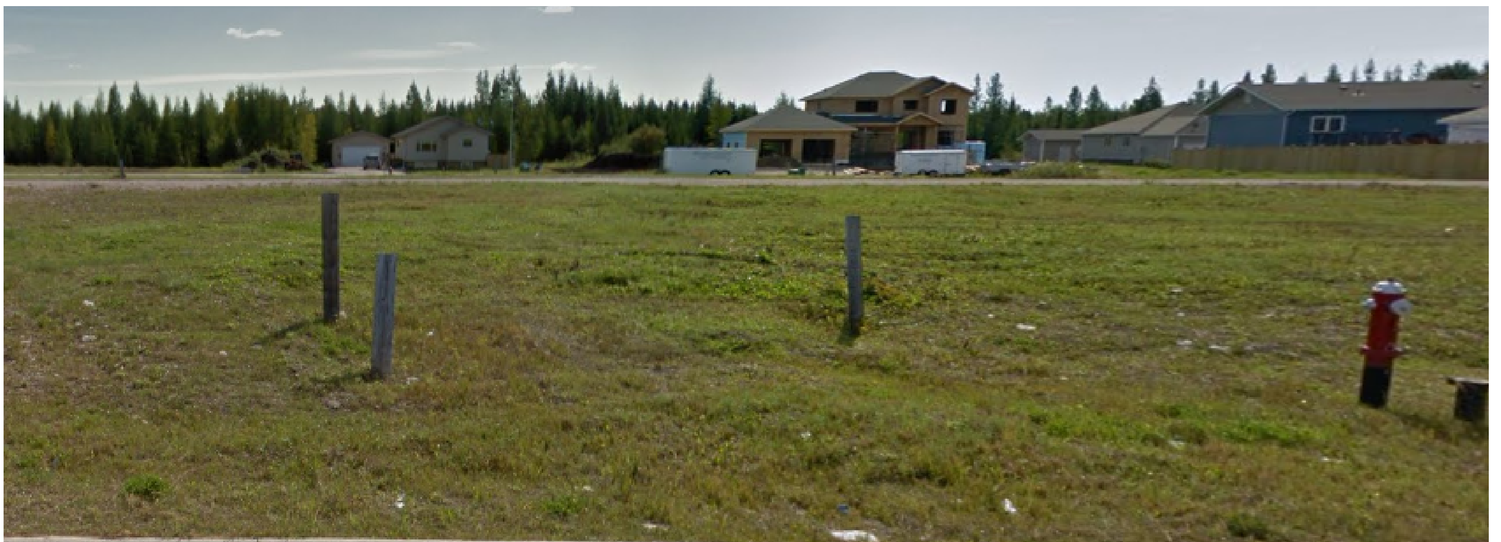
Campbell Drive - street view