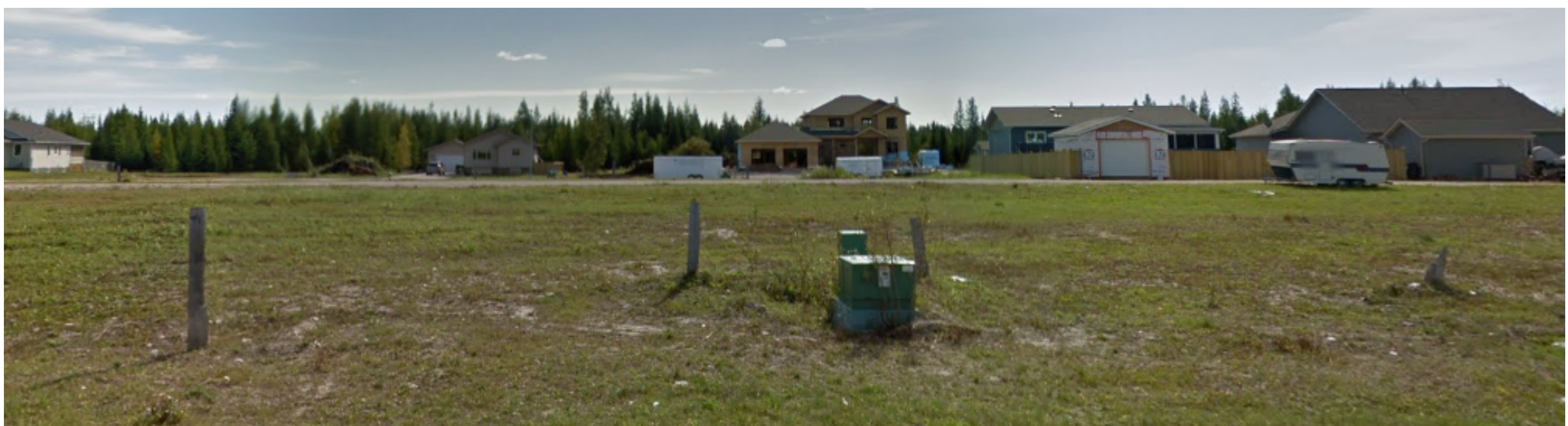
Campbell Drive - street view