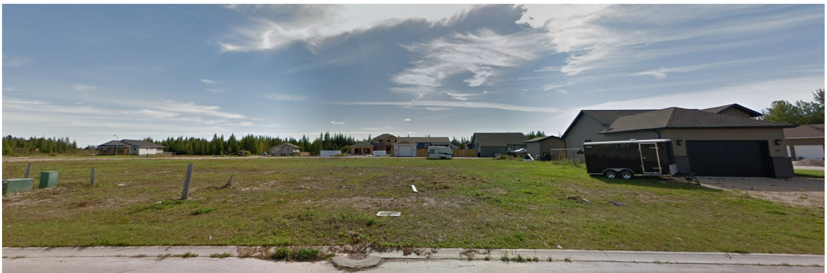
Campbell Drive - street view