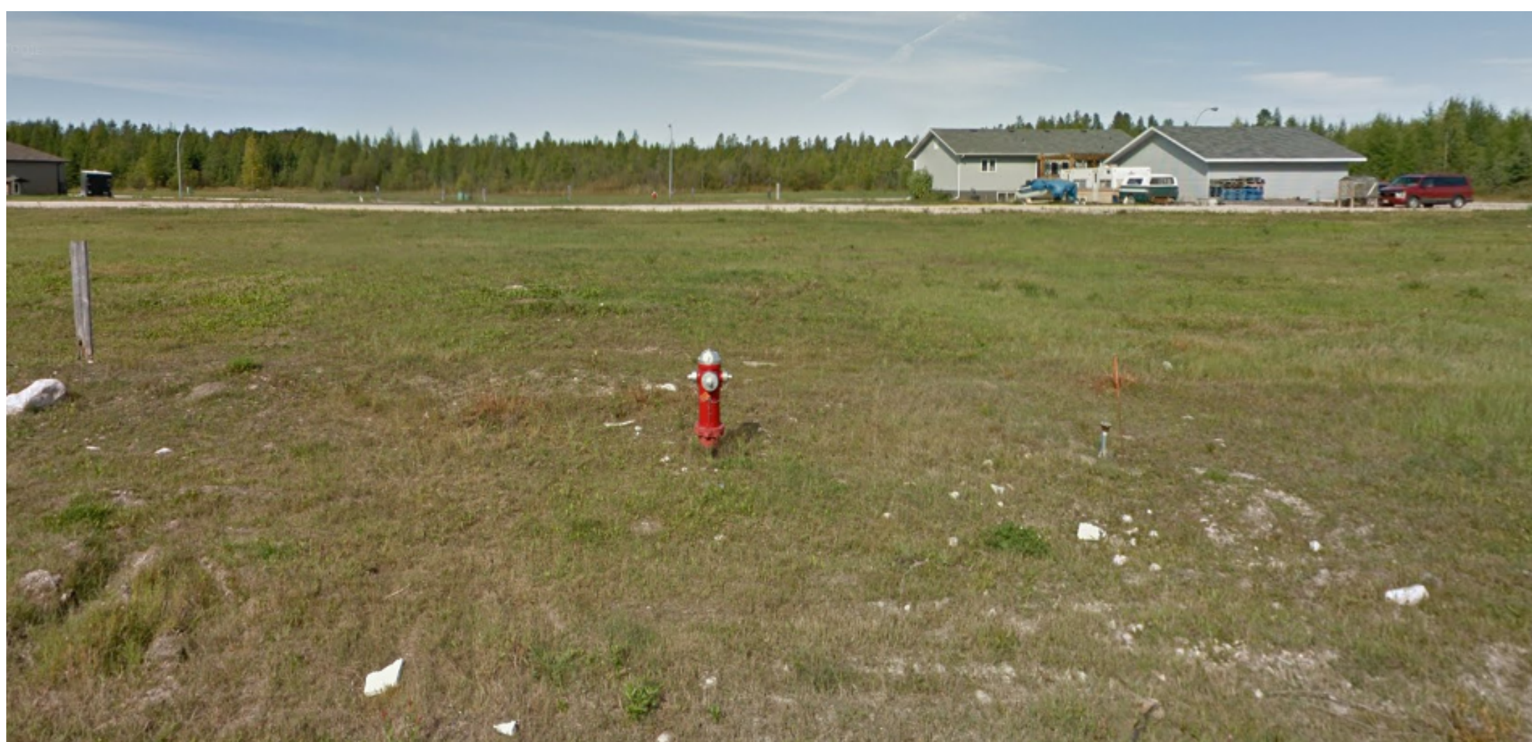
View from Watts Street