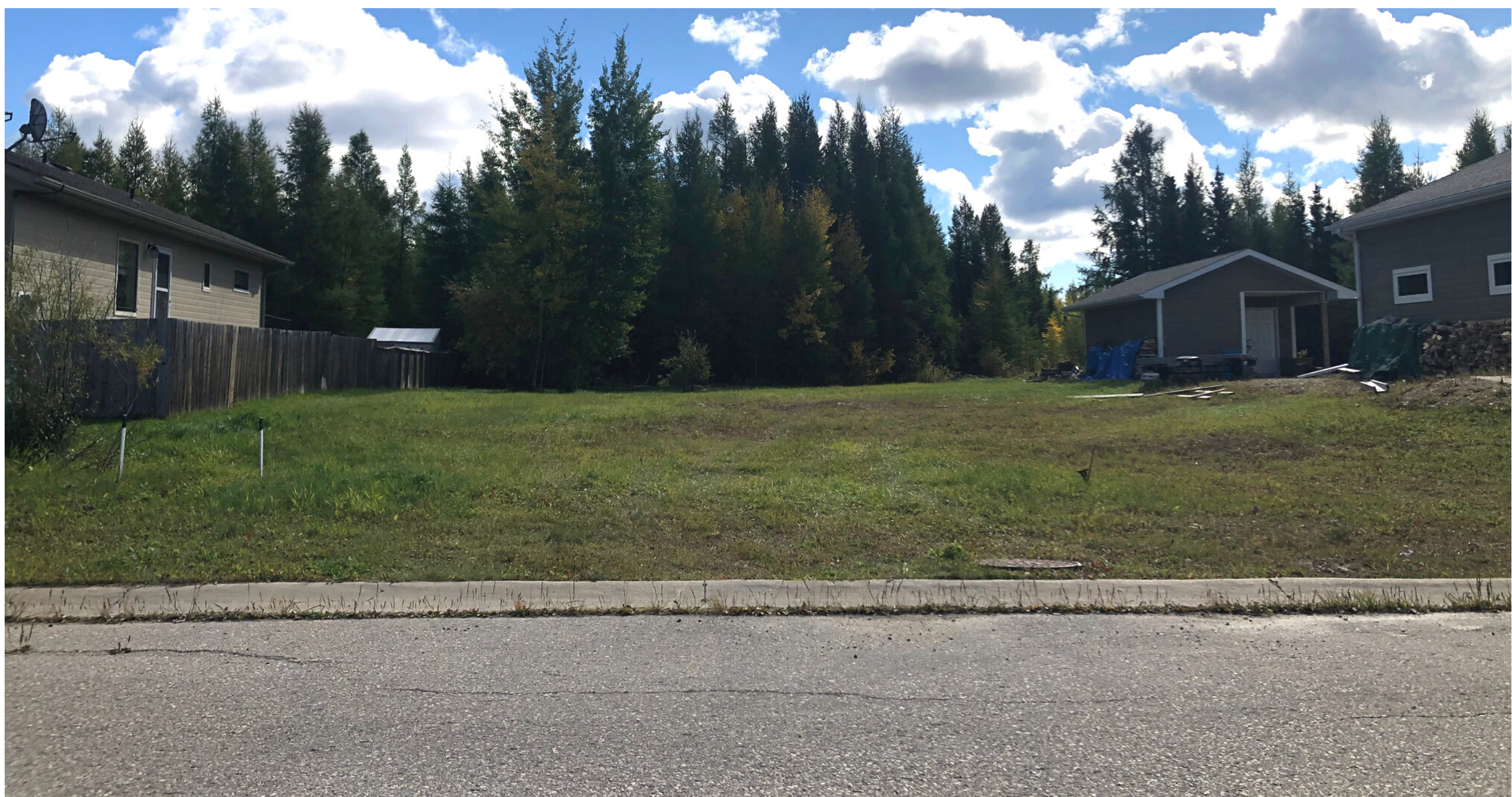
View from Watts Street