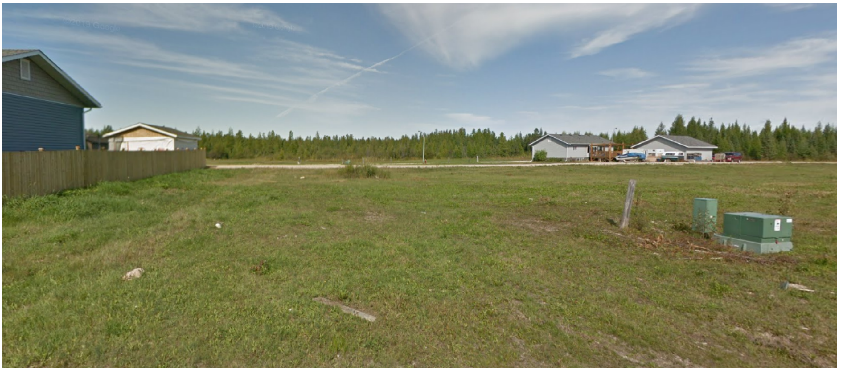
View from Watts Street